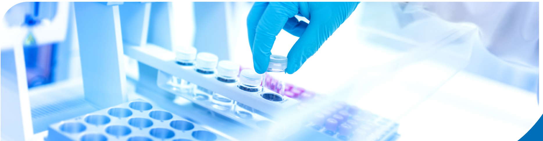
Represents 2020 Data Values